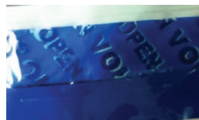
Result of being attacked with heat elements below 70°C