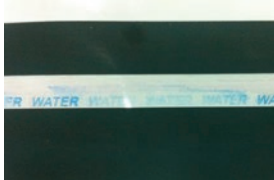
Result after being attacked by liquids such as water, cream, oil, lotion