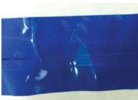
Perfectly sealed condition