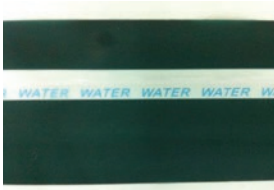
Perfectly sealed condition