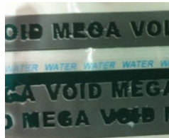
Result after being attacked by peeling in ambient temperature