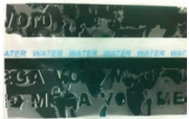
Result after being attacked by Freon/cold spray